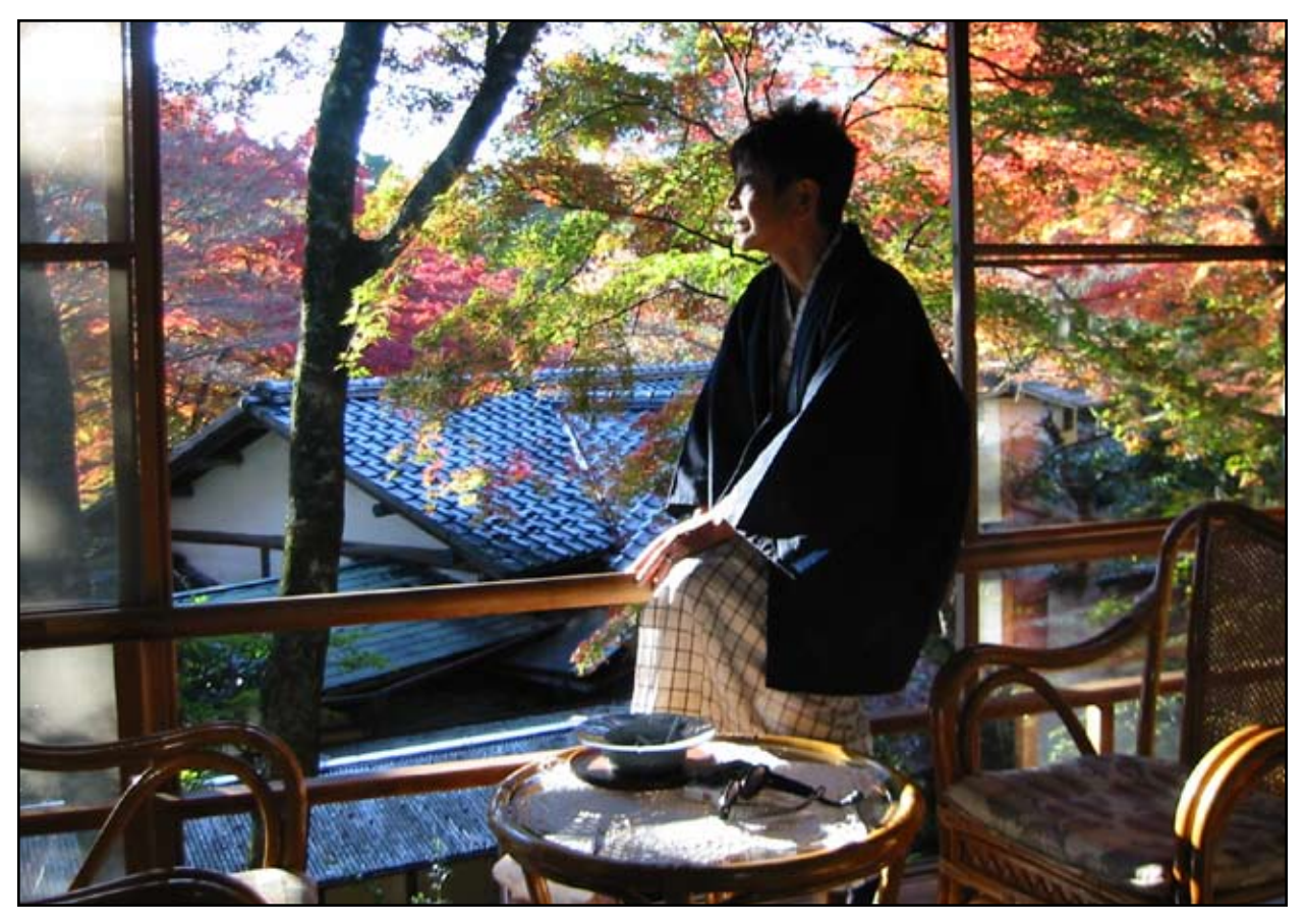
Yoshi perches on a window railing at the Kansui-roh inn, bathed in light from a setting sun.