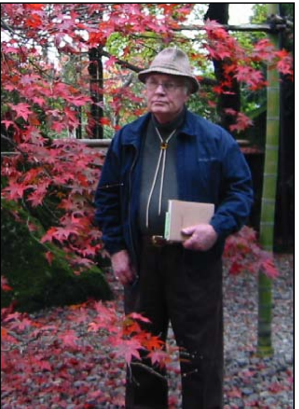
Excerpted from the journal of Jackson Sellers, 2004